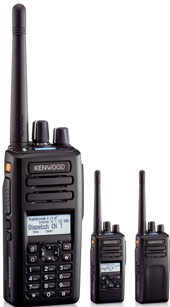
Full Keypad Model